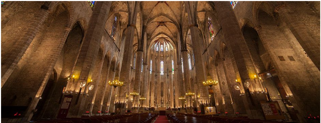
OUR LADY OF THE SEA CHURCH